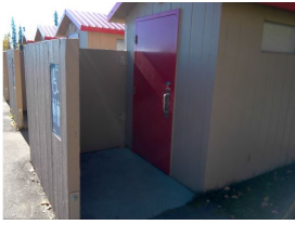
Description of Photo 1 : All washrooms have privacy walls in front of the doors