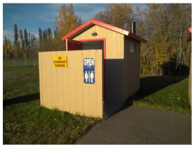
Description of Photo 3 : The front of the pit toilet all other washrooms are accessible