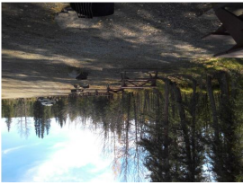
Description of Photo 1 : Campsites are close together