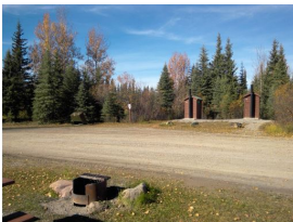
Description of Photo 3 : A view of the inaccessible toilets