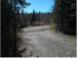
Description of Photo 2 : One of the more secluded campsites