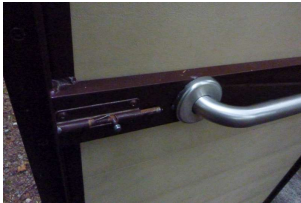
Description of Photo 2 : inner lock on outhouse door