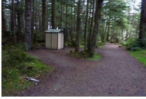
Description of Photo 1 : route to outhouse